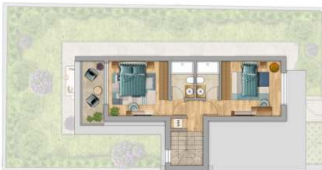
1 st floor